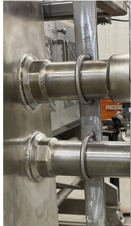
Process piping system used as raceway in violation of NEC and OSHA regulations