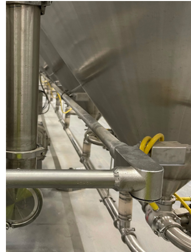
Process piping system used as raceway in violation of NEC and OSHA regulations