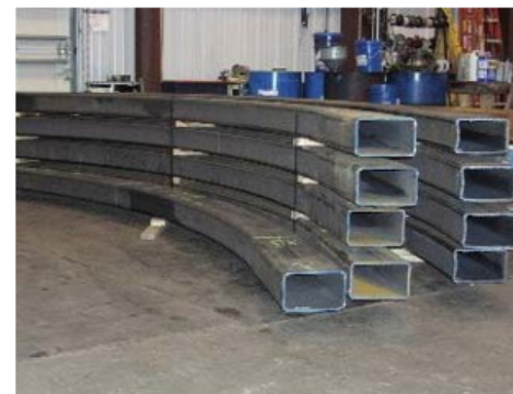
(b) Bent “the hard way”