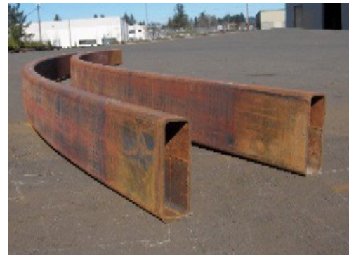
(a) Bent “the easy way”