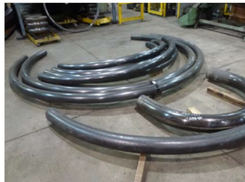
Figure 1: Three-roll bending apparatus for curving round HSS, and the final product