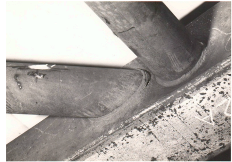
(a) gapped K-connection

Experimental research has been performed on a considerable number of round-to-rectangular HSS N-connections (a special case of the general K-connection) and it has been observed that the connection limit states resemble those of similar rectangular HSS connections. An inspection of contemporary design recommendations reveals that most failure modes for hollow section connections are dependent on the circumference or “footprint” of the branch member at the joint with the chord, or dependent on the cross-sectional area of the branch members. The perimeter of a round HSS of diameter D_b is \pi D_b , and that of a square HSS of width D_b is 4D_b (excluding the rounded corners), thus approximately in the ratio of \pi : 4 . Similarly, the cross-sectional area of a thin round HSS of diameter D_b and thickness t_b is approximately \pi D_b t_b , whereas the cross-sectional area of a thin square HSS of width D_b and thickness t_b is approximately 4D_b t_b , again in the ratio of \pi : 4 . (Note that well-designed HSS truss-type connections will have branches that are thin relative to the chord thickness). It was hence surmised that round-to-rectangular HSS welded connections could potentially be treated as square-to-rectangular HSS connections, by converting the round branch members to square sections.