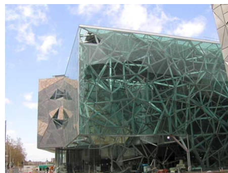
Figure 1: A 3D jumble of rectangular HSS in a feature atrium, with multi-planar welded connections

AISC 360-16 Specification Section K1 starts by noting its scope: “For the purposes of this chapter, the centerlines of branch members shall lie in a common plane” (AISC, 2016). In practice, however, a great number of hollow section structures have not just planar welded connections but multi-planar connections. These may arise in towers, offshore structures, crane gantries, bridges, canopies, atria, lattice columns and roof structures. Free-form architecture has liberated and encouraged artistic expression, to the extent that designers now feel that almost any three-dimensional arrangement of members can be specified – and built. This may lead to considerable fabrication challenges such as the example in Figure 1.